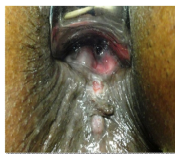
Figure 4: Chronic fissure with tag and fistulous opening