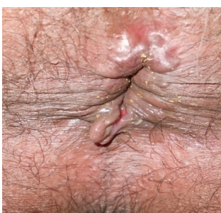
Figure 3: Chronic fissure with tag and external 11'o' clock hemorrhoid