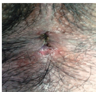
Figure 1: Acute fissure in ano

In secondary fissure where colitis is primary disorder bilwa ( Eagle marmelos ), kutaj ( Holarrhena antidysentrica ), takra (butter milk) can be the first line of treatment.