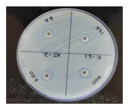
Figure 5 & 6: sensitivity test showing zone of inhibition