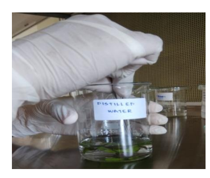
Figure 1 - surface sterilization