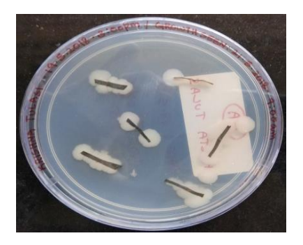
Figure 2: Growth of endophytic