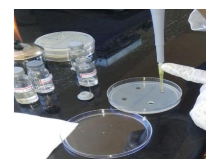
Figure 4: agar well diffusion method