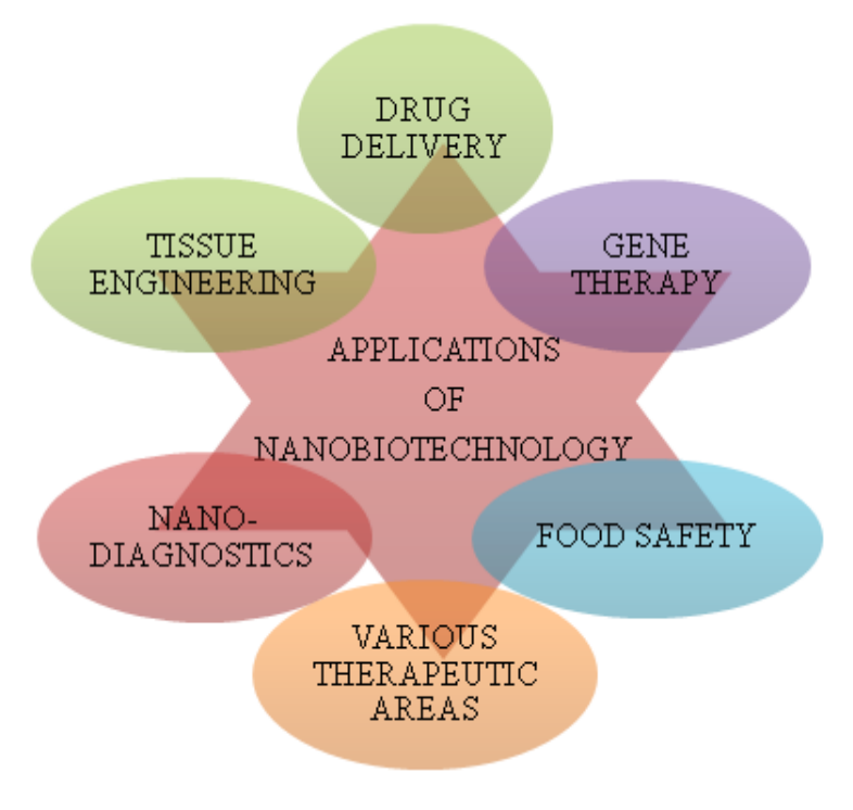
Figure 2: Various applications of Nanobiotechnology

Nanobiotechnology has applications in various areas such as drug delivery, blood substitutes, gene therapy, tissue engineering, nano diagnostics and food safety (Figure 2)